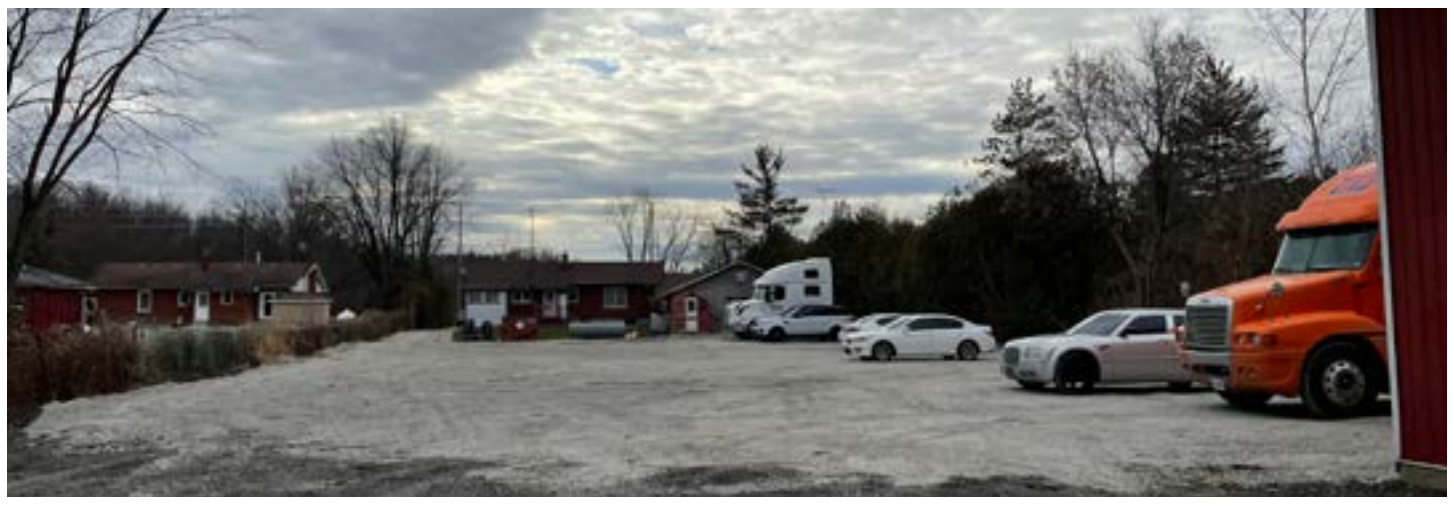
Illegal truck terminal operating from an agricultural-zoned property

A property cannot be used for a different purpose than the one for which it is zoned. For example, most types of commercial businesses (e.g. auto repair garage) cannot be operated from a property that is zoned residential. The exception to this is when the use is allowed as a home occupation permitted under the zoning by-law.