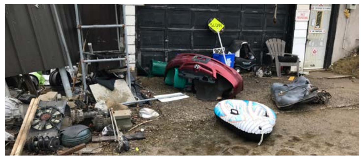
Debris on a residential property