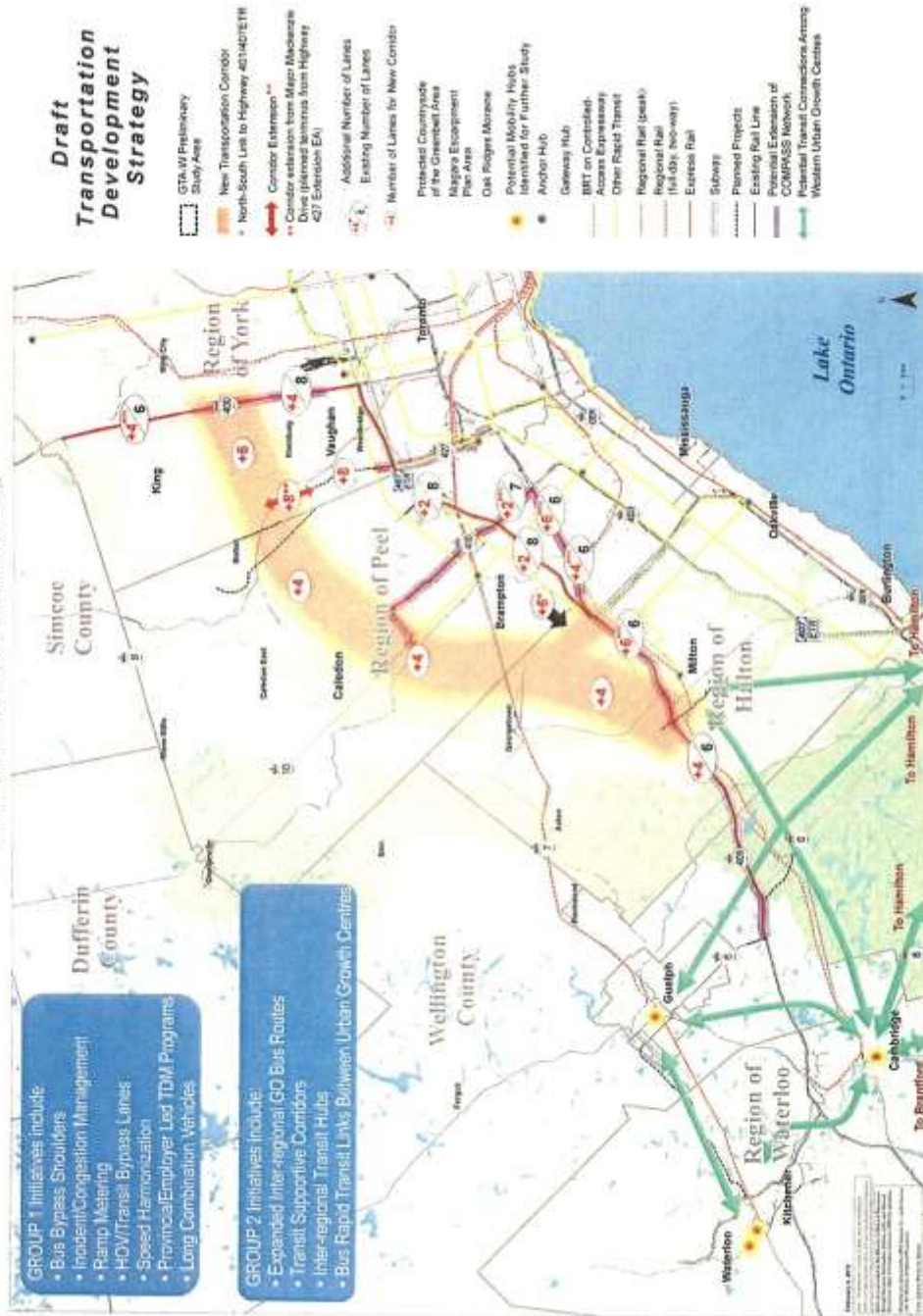
Exhibit 1-15: Draft Transportation Development Strategy