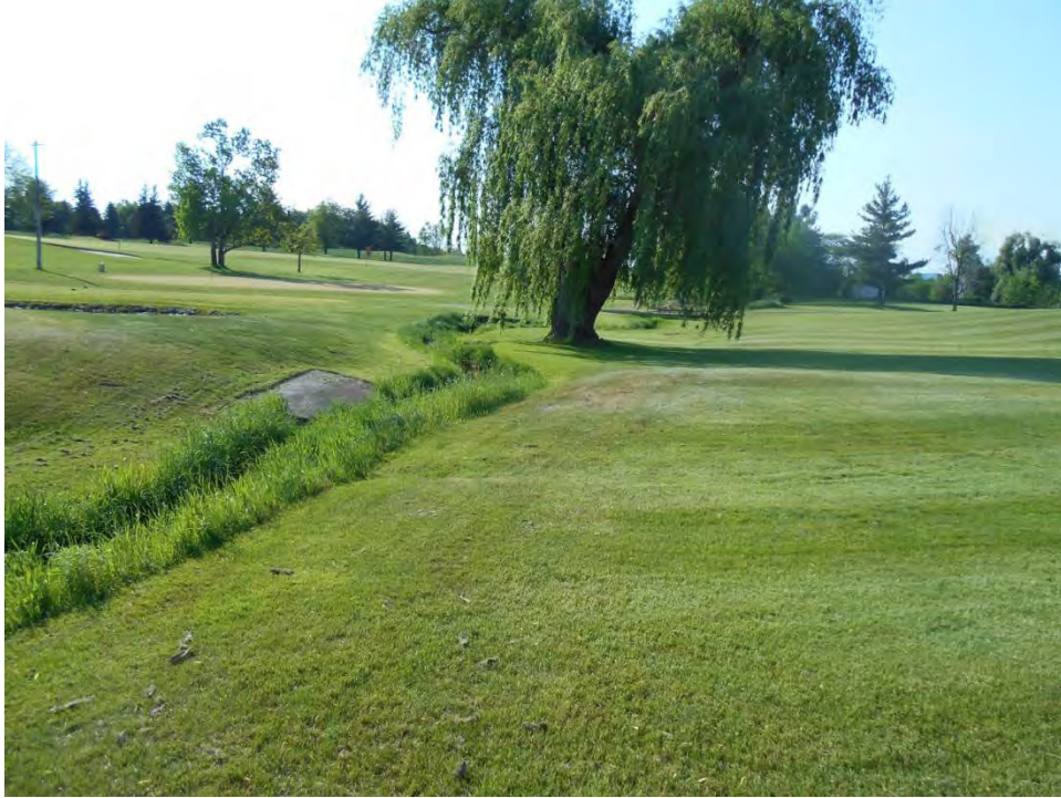
Photo 3. Downstream portion of reach, looking upstream.