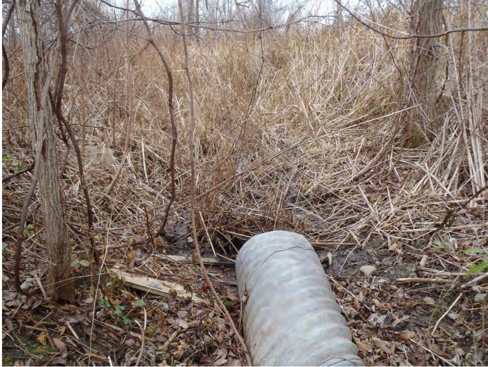
Photo 24. Downstream extent, looking upstream.