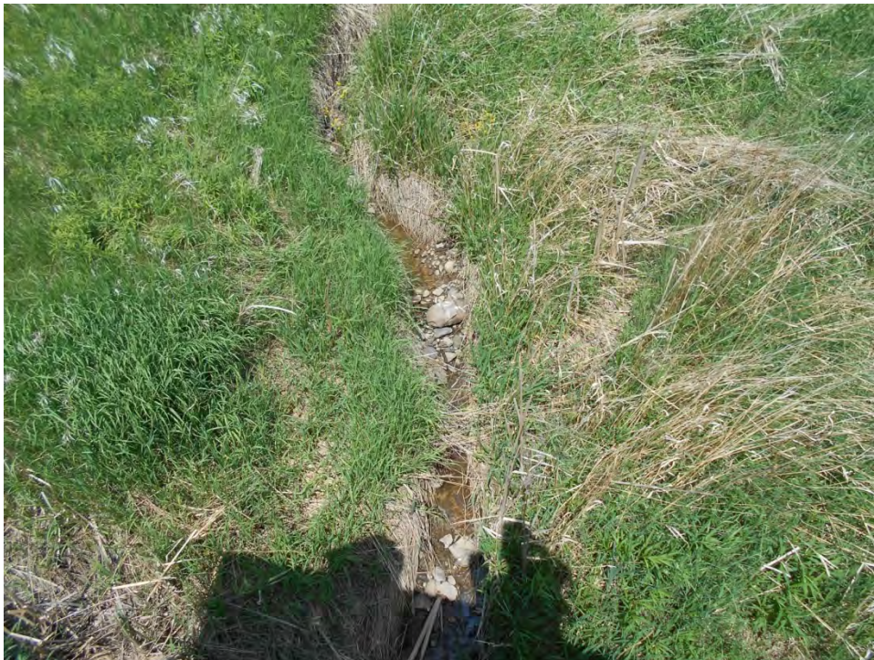
Photo 47. Looking upstream at channel.