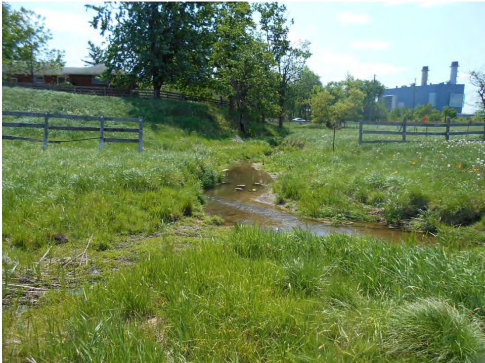
Photo 32. Downstream extent, facing downstream, Steeles-002 (left) is converging with Steeles-003 (right).