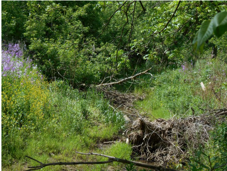
Photo 41. Upstream extent, looking upstream.