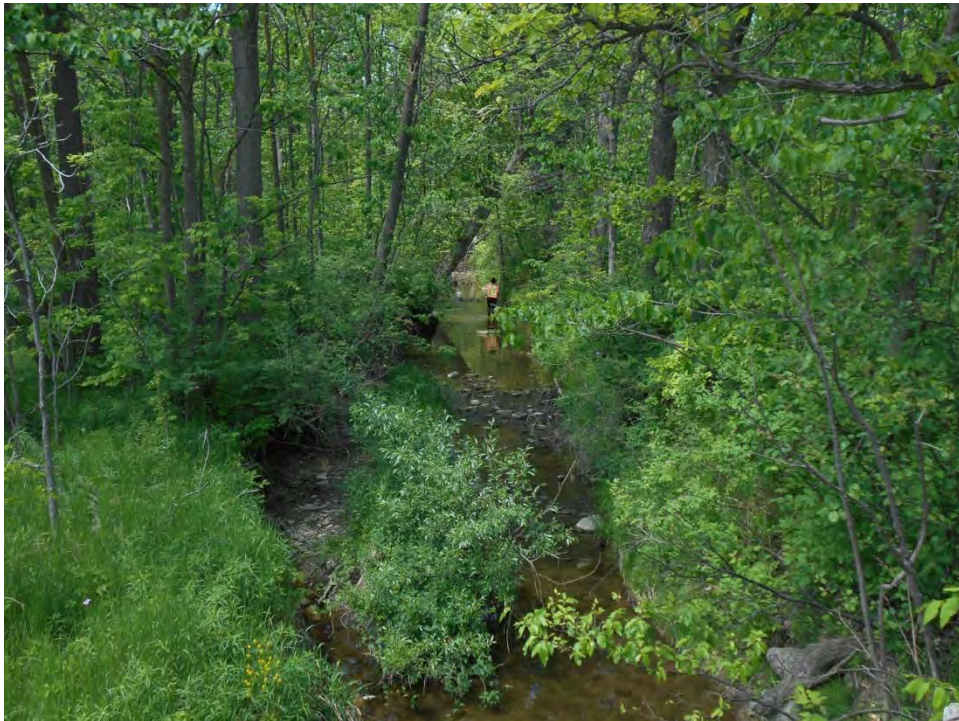
Photo 52. Looking upstream from road crossing.