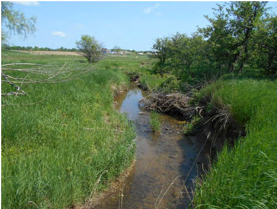
Photo 34. Upstream extent, looking downstream.