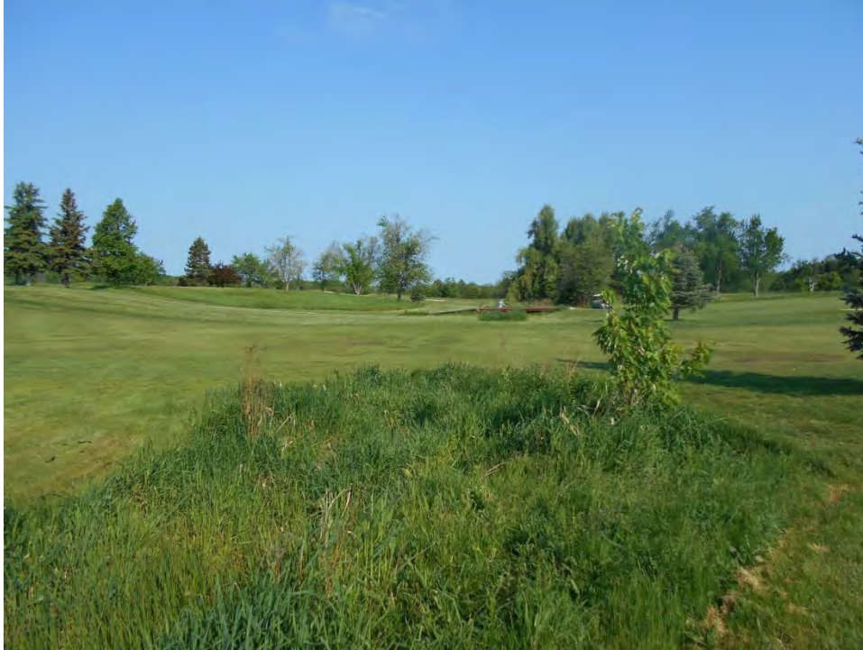
Photo 5. Upstream extent of the reach, looking upstream.