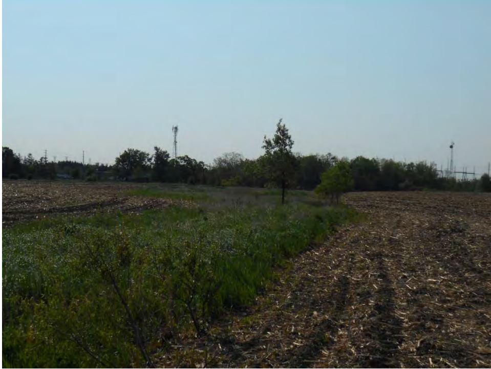
Photo 28. Mid-reach, looking upstream.