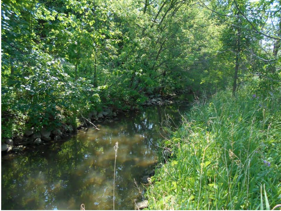
Photo 40. Downstream extent, looking downstream.