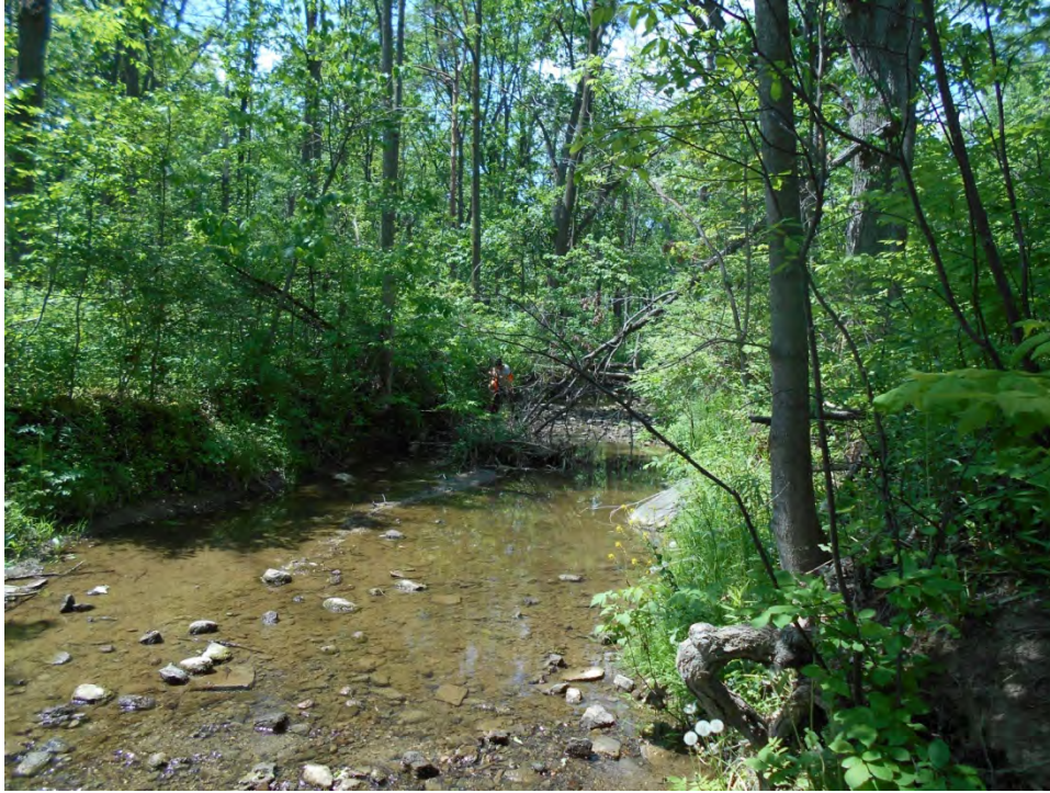
Photo 49. Upstream extent, looking upstream.