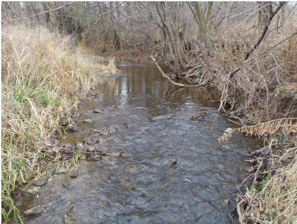
Photo 19. Upstream extent, looking upstream from main channel.