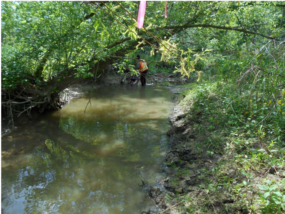
Photo 44. Downstream extent, looking upstream.