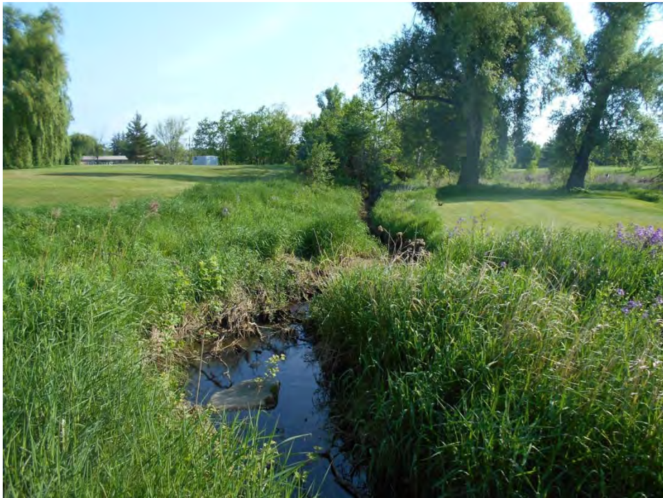
Photo 4. Downstream extent, looking downstream.