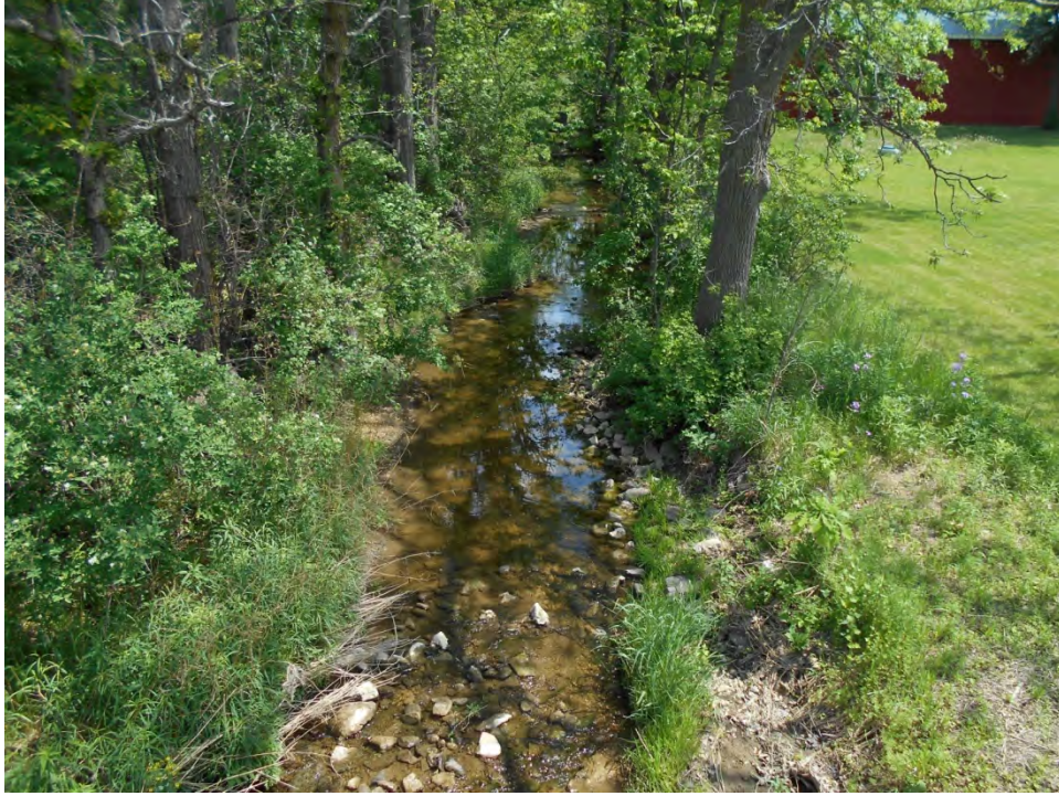
Photo 53. Looking downstream from road crossing (downstream extent).