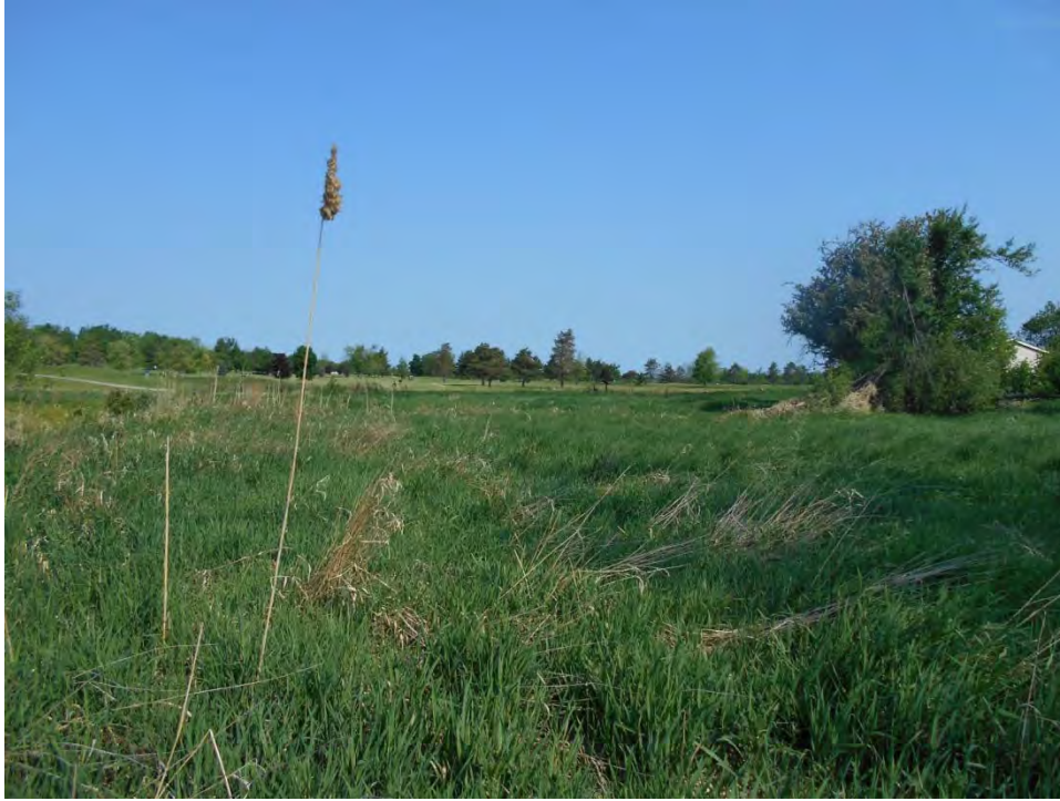
Photo 26. Upstream extent, looking upstream.