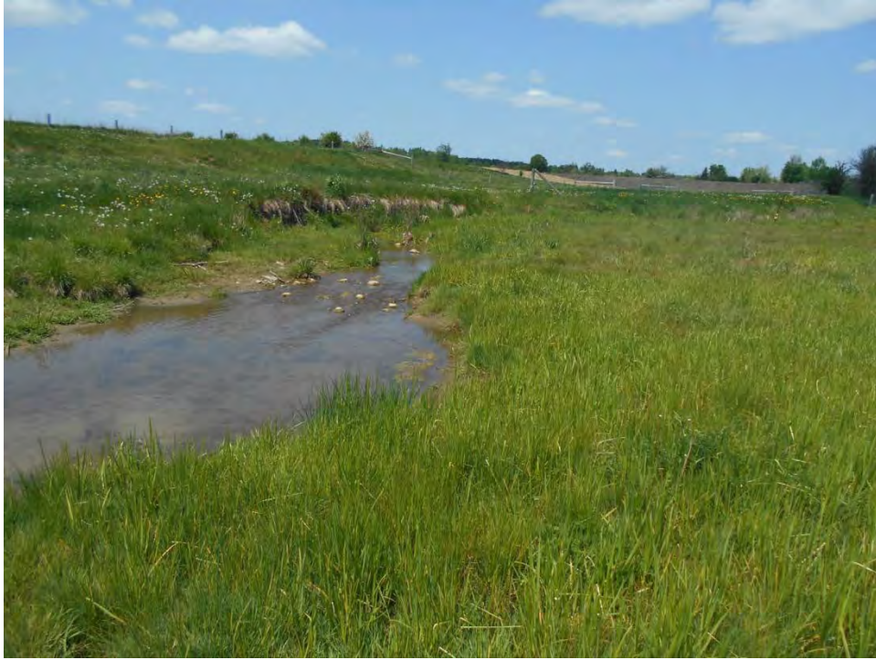
Photo 29. Upstream extent, looking upstream.