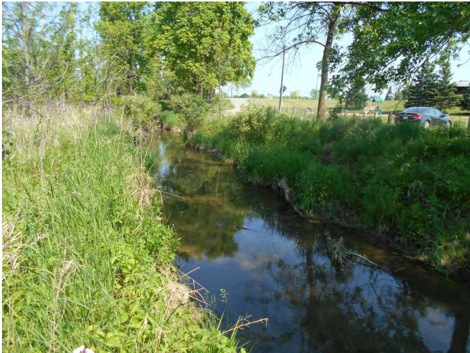
Photo 39. Downstream extent, looking upstream.