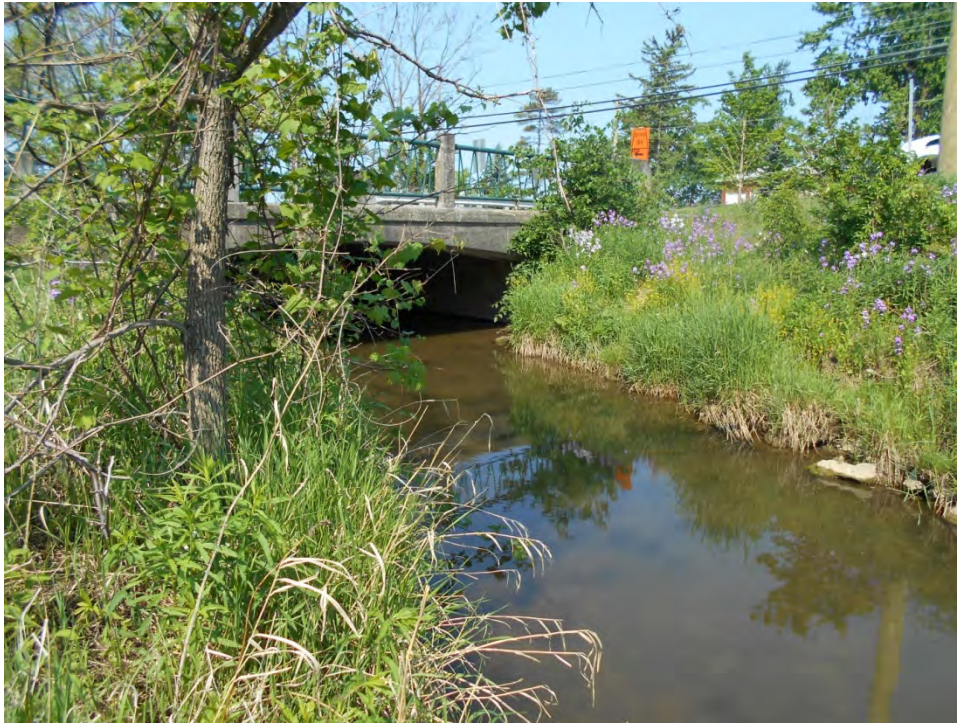
Photo 36. Upstream extent, looking upstream.