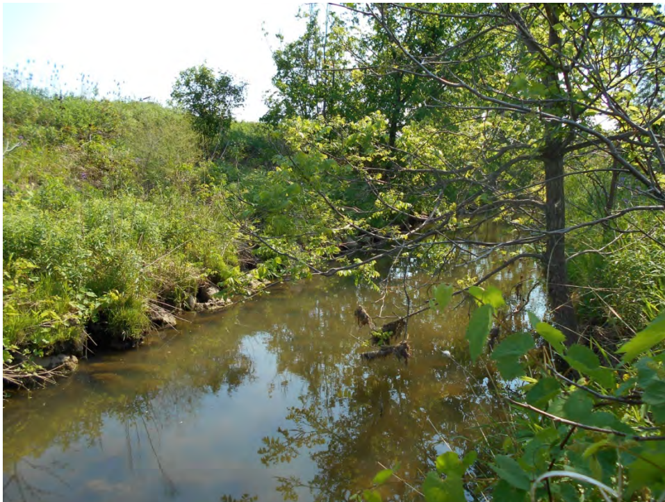
Photo 37. Upstream extent, looking downstream.