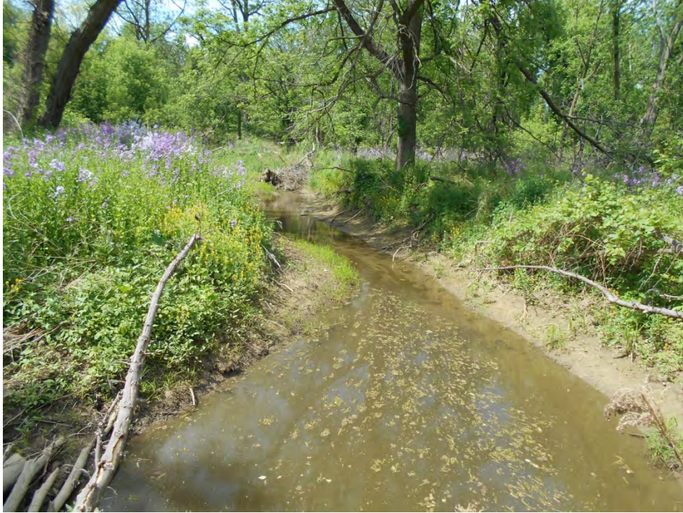
Photo 43. Mid-reach, looking upstream.