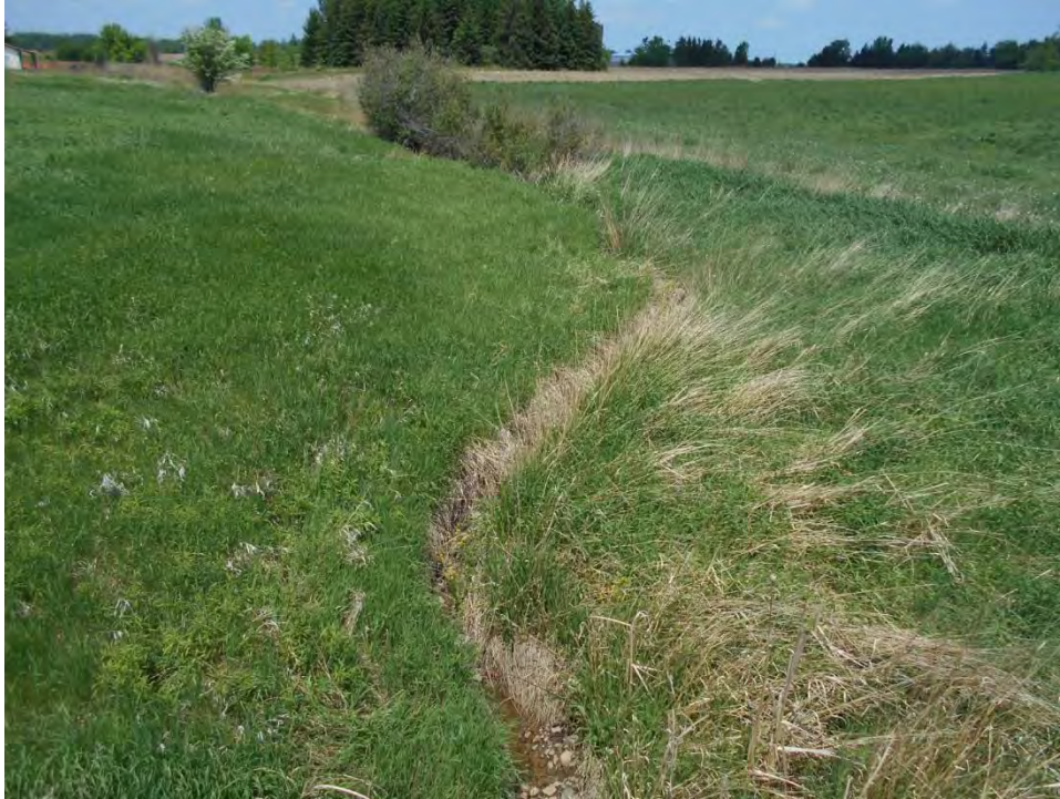
Photo 46. Looking upstream from road crossing.