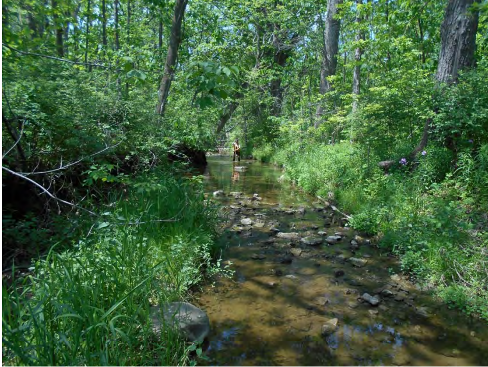
Photo 51. Downstream extent, looking upstream.