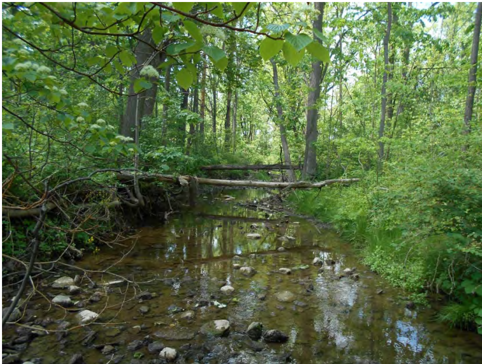
Photo 50. Upstream extent, looking downstream.