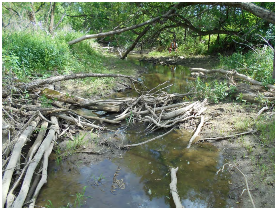
Photo 42. Mid-reach, looking downstream.