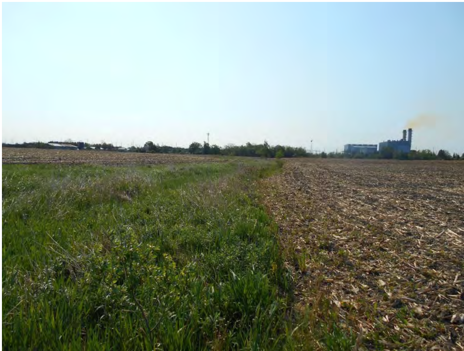
Photo 27. Mid- reach, looking downstream.