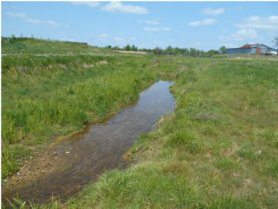
Photo 30. Mid-reach, looking upstream.