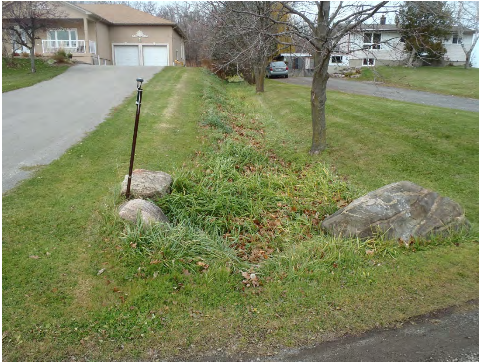
Photo 22. Upstream extent, looking upstream.