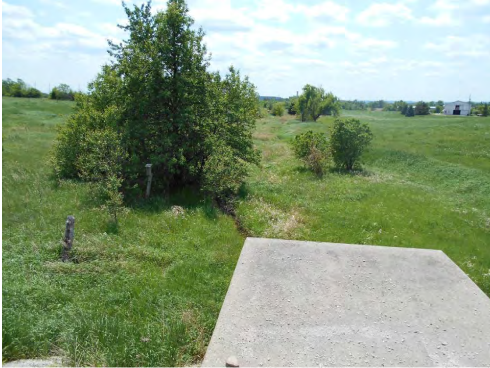
Photo 48. Looking downstream from road crossing.