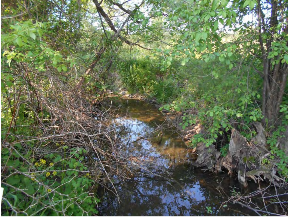
Photo 10. Upstream extent, looking downstream.