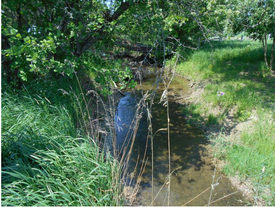
Photo 33. Upstream extent, looking upstream.