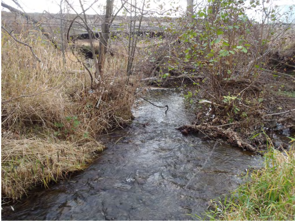
Photo 20. Upstream extent, looking downstream of main channel.