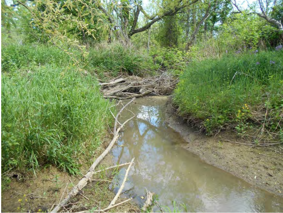
Photo 45. Downstream, extent, looking downstream.