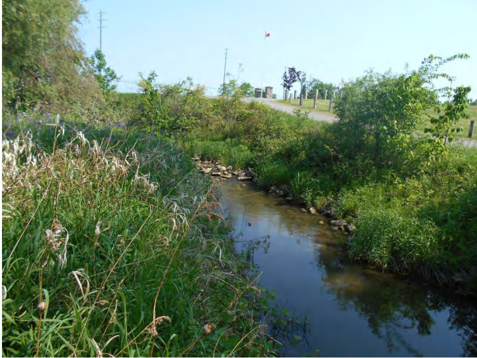
Photo 38. Mid-reach, looking upstream.