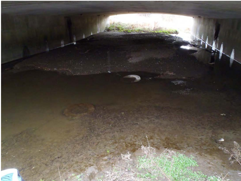
Photo 21. View under bridge facing downstream of main channel.