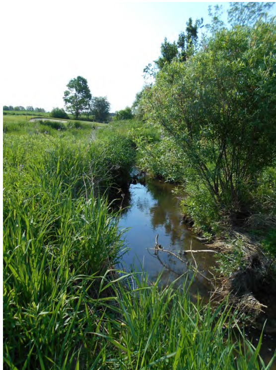
Photo 11. Mid reach, looking downstream.