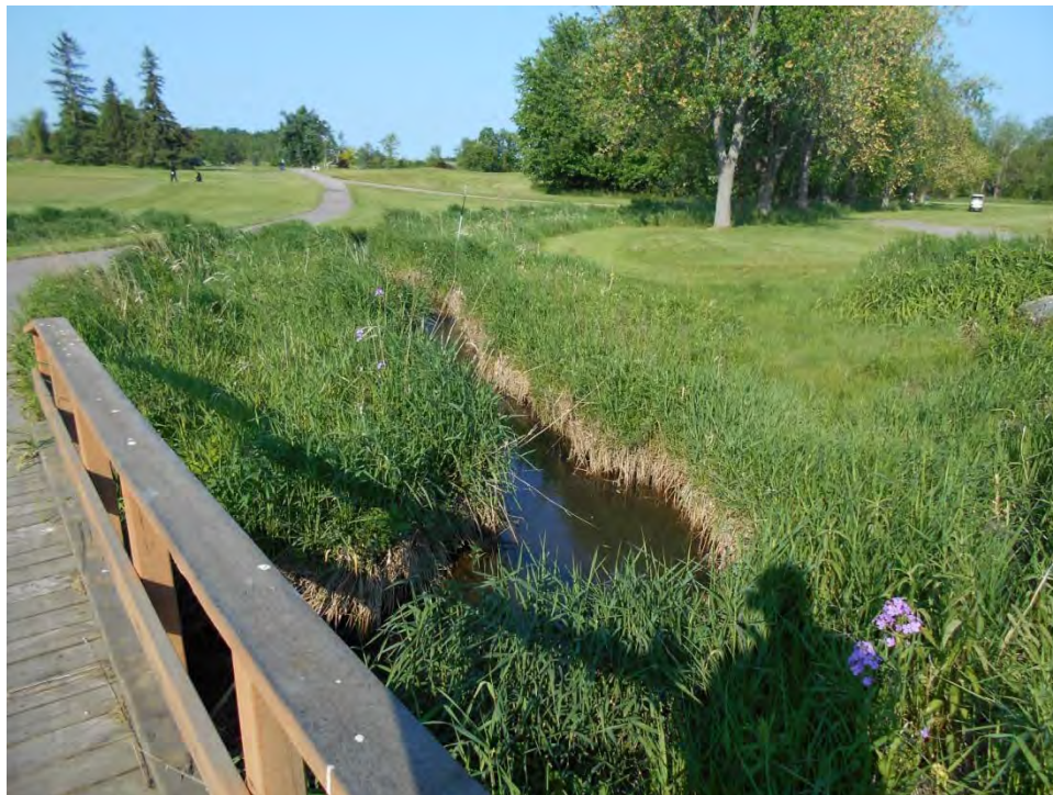
Photo 2. Mid-reach, looking upstream.