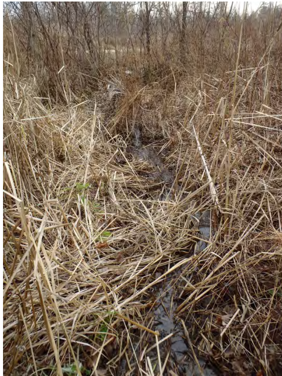
Photo 25. Downstream extent, looking downstream.