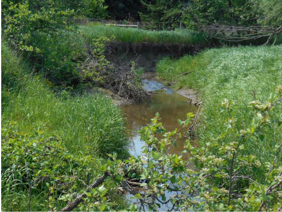
Photo 35. Mid-reach, looking upstream.