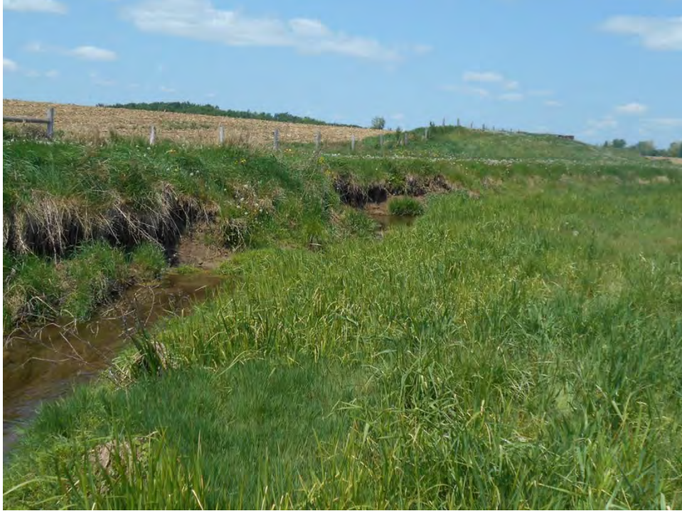
Photo 31. Downstream extent, facing upstream.