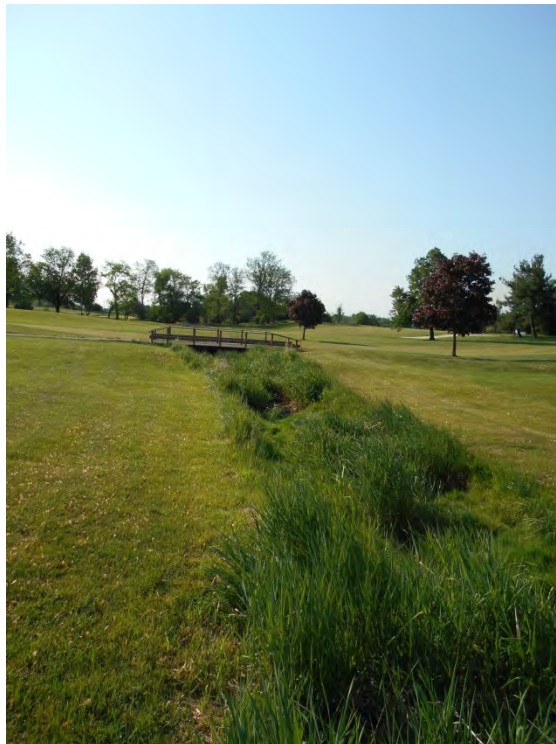
Photo 6. Upstream extent of the reach, looking downstream.