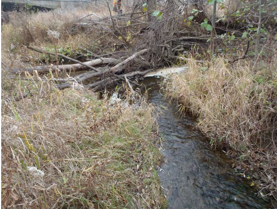
Photo 18. Upstream extent, looking downstream of east channel.