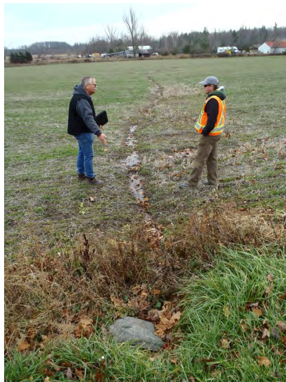
Photo 23. Upstream extent, looking downstream.