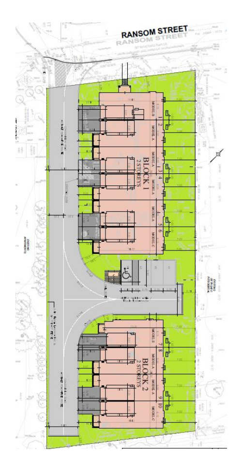
Figure 1: Concept Plan

Further details regarding the proposal are outlined in the table below.