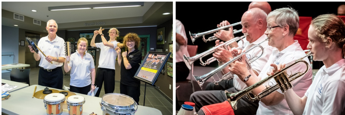
Photos: On Beat in the Hills! Instrument Petting Zoo and Performance

The band is currently preparing for a few of this year's performances, including a Spring Concert, Classic and Iconic Car, Toy Drive 2019, 7 th Annual 'With Glowing Hearts – A Musical Tribute to the Armed Forces'. Later on this year, rehearsals will prepare for the annual Remembrance Day Services, Georgetown and Milton Santa Claus Parades as well as the annual Christmas Concert at Market Place Mall.