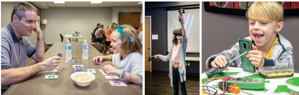
Photos: Library Programming: Boardgame Night, Virtual Reality, Repair Cafe

The Halton Hills Public Library enriches the community with extensive cultural programming throughout the year, often in coordination with community partners. Highlights of 2018 successes include: