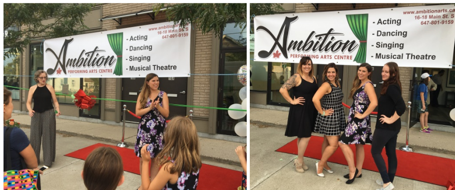
Photos: Grand Opening of Ambition Performing Arts Centre

Ambition, a new multi-discipline performing arts facility had its grand opening in Acton in August, 2018. Ambition offers classes in dance, singing, music, and theatre, as well as stage and screen acting for all ability levels and ages 3 to 18.