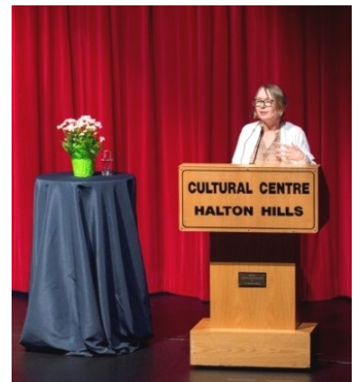
Photo: Shari Lapena at the John Elliott Theatre.