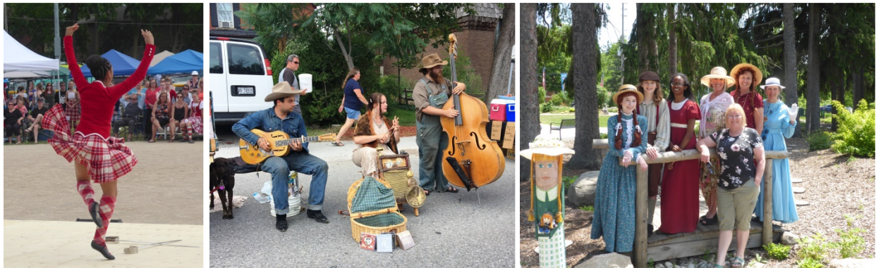
Photos: Highland Games, Leathertown Festival, Anne of Green Gables Day

The following are highlights of community-led initiatives that are contributing to the Cultural Vibrancy of Halton Hills: