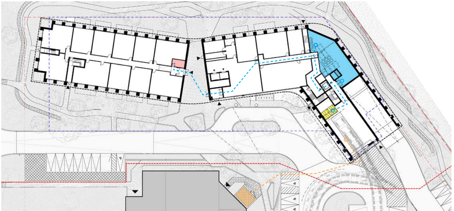
Figure 2: Ground floor residential waste disposal and storage. Building operations waste relocation route and main storage adjacent to loading bay. Church waste storage relocated to NE corner of church, with church waste moved to the main loading area ahead of collection days.

Ahead of collection days, waste disposed via the waste chute from floors above, will be compiled and moved to the staging area at the front of the loading bay. Waste from the ground floor residential waste storage room will be moved to the main waste storage area ahead of collection days by building operations. The existing church waste storage area has been relocated to the NE corner of the church. Ahead of collection days church waste will be moved to the main loading area.