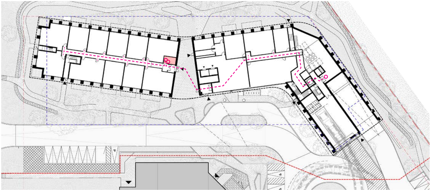
Figure 2: Ground floor residential waste disposal and storage. Building operations waste relocation route and main storage adjacent to loading bay.

Residents located on the west side of the ground floor will have access to a waste storage room located off the entrance vestibule to this area. Building operations will be responsible for collecting and relocating waste from this area to the main waste storage area located adjacent to the loading bay on collection days. The units on the right have the option to use either the waste storage room or use the service elevator to deposit waste in the garbage area.