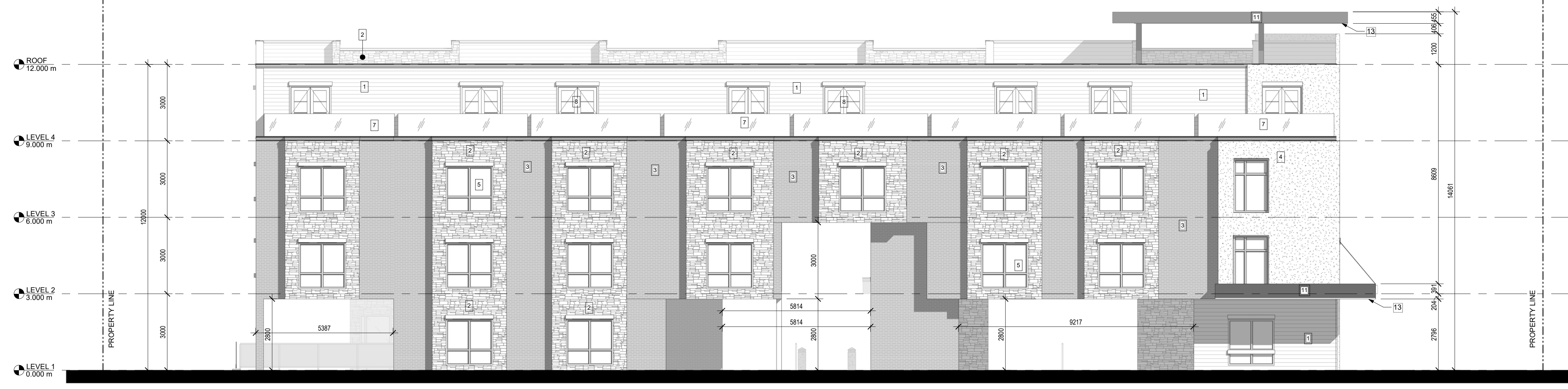
2 SOUTH ELEVATION 1:100