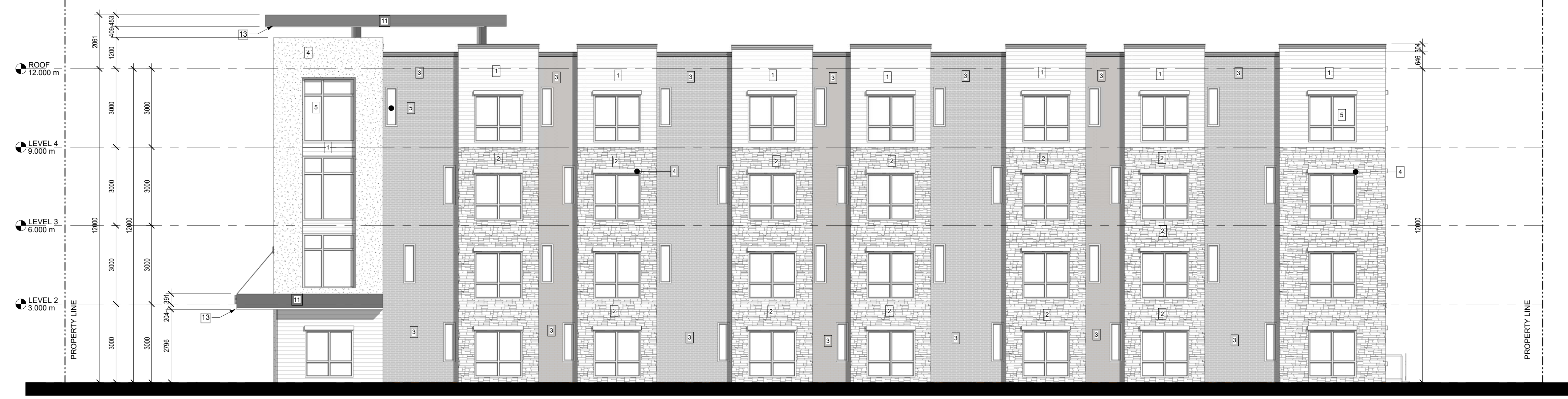
1 NORTH ELEVATION 1:100