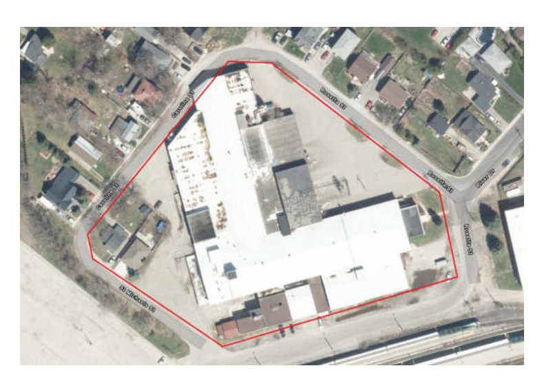
Figure 1. 1 Rosetta Street. Georgetown, ON L7G 3P1

The Urban Arborist Inc was retained by Byron Equities to prepare a Tree Inventory / Protection Plan for a condominium development complex with 3 buildings. The entire site would be developed and impacted.